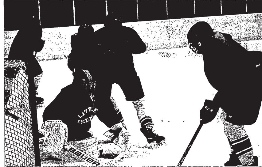
Ames High School hockey players practice at the Ames/ISU Ice Arena on Tuesday.